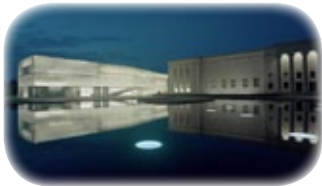
Nelson-Atkins Art Museum