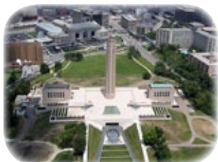
Liberty Memorial-WWI Museum