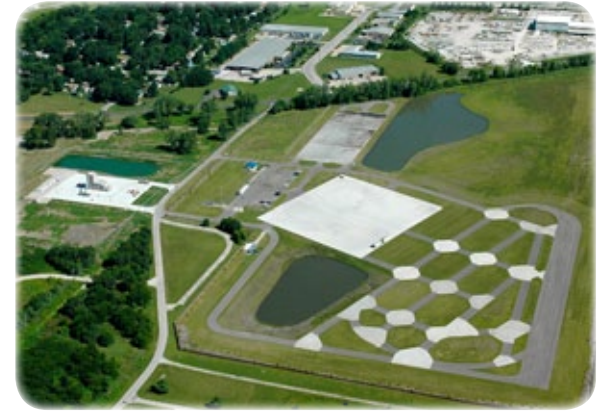
Blue River Precision Driving Complex

Fee for the event is $35. SCCA membership is required, a $15 event membership will be available. There are rumors that several Stingers will be in the line up.