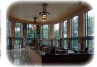
The Hall of Waters and its water bar.

The old depot now is the home of the Wabash Bar-be-que and Blues Garden. Featuring live music and perhaps the best ribs in Kansas City.