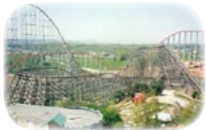
Worlds of Fun

Half an hour away in Kansas City are many more attractions; Worlds of Fun, the Country Club Plaza, Nelson-Atkins Museum of Art, Negro Leagues Baseball Museum, Liberty Memorial WWI Museum, and the Power and Light District.